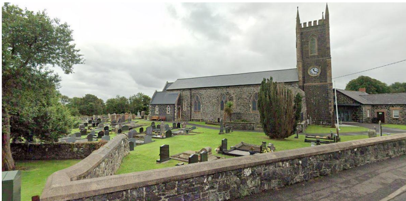
St. Mary's Church of Ireland Church, Macosquin

St. Mary's Church of Ireland Churchyard, Macosquin, Northern Ireland contains 4 Commonwealth War Graves – 3 from World War 1 & 1 from World War 2. There is only 1 Australian Forces burial.