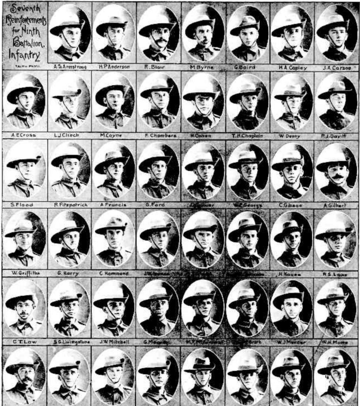
(The Queenslander Pictorial within The Queenslander – 17 July, 1915 – page 26)